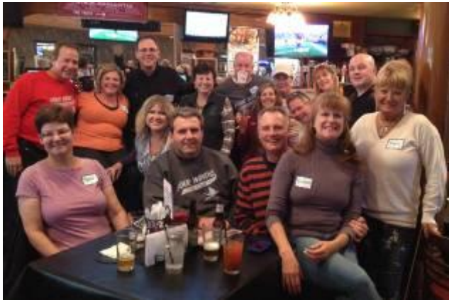
At Harry's in Arlington Heights